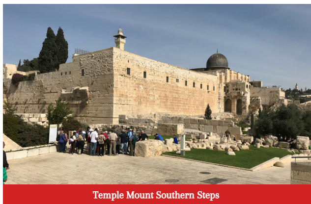
Temple Mount Southern Steps