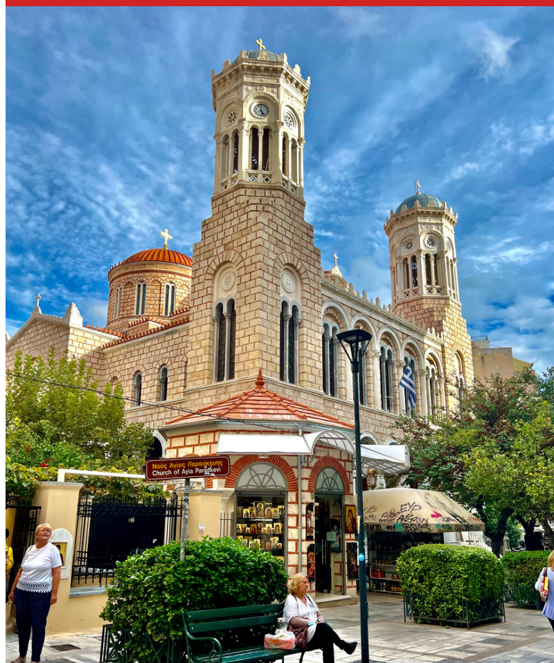
Greek Orthodox Church

*Airfare is based on current pricing and will be finalized May 2024.